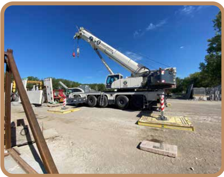
Six Crane Service purchased a new Demag AC220-5 this Spring