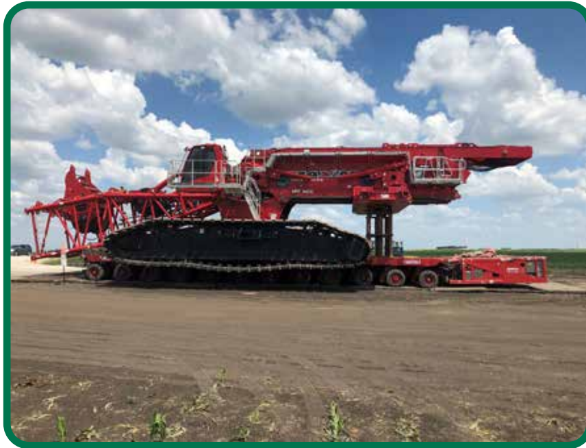
Maniotowoc MLC 650 loaded on Fagiolio transport on Mortenson's repower project near Palmer

Please sign up for classes by visiting www.local234.com where you will find a quick link to the International's website for review of the training schedule and to register.