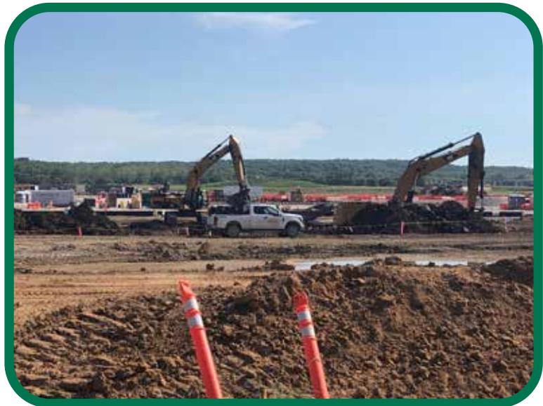
McAninch crews at the new Microsoft project on Booneville Road in West Des Moines