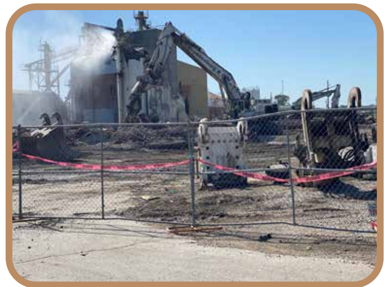
Brandenburg Industrial demoing stacks at Cargill in Des Moines