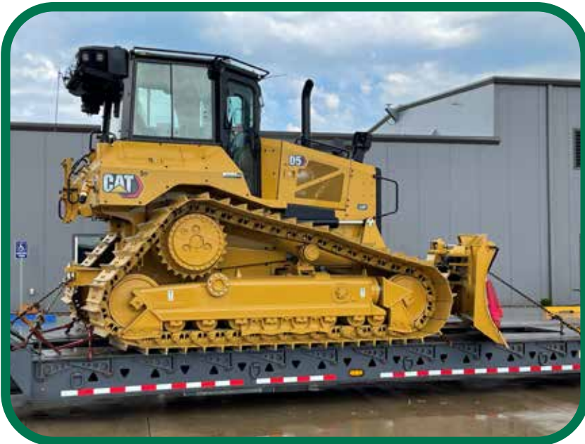
New Cat D5 dozer purchased by the training fund