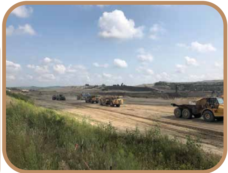
Local 234 Members working at the Fly Ash Pond closure for Ames Construction