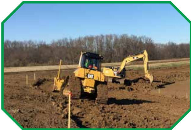
Apprentice dirt equipment training