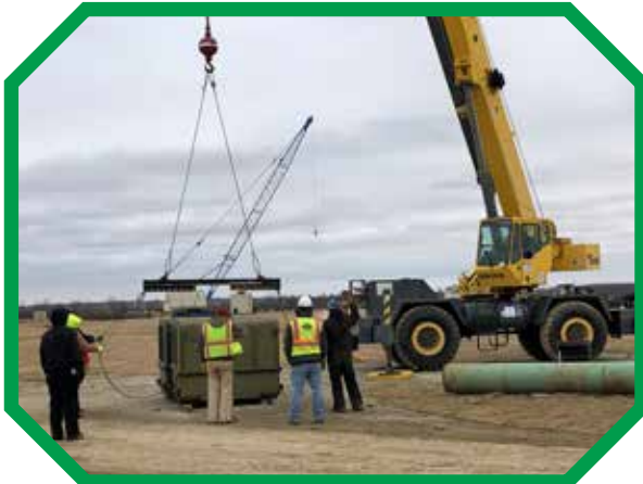
Crane signal person training