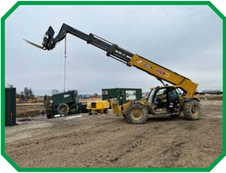
Brother Mitch Mundorf operates a Caterpillar Forklift for Northwest Steel at the new Altofer Caterpillar dealership building in Cedar Rapids