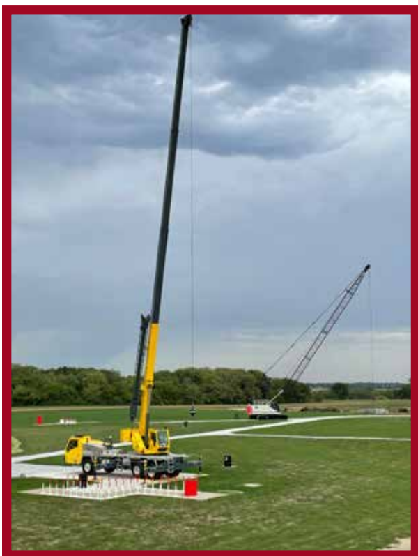
Local 234 Members doing crane training onsite