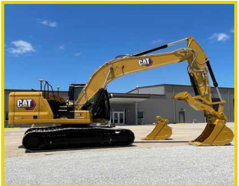
The new CAT 323 excavator purchased by the training site